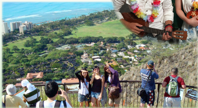
View from top of Diamond Head Crater

Cover: Kilauea lava lake